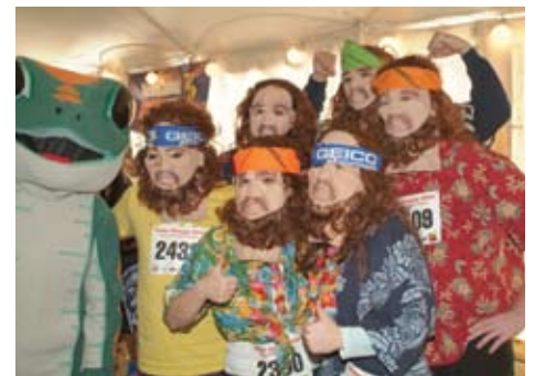
The GEICO Gecko and a team of Cavemen get ready to take the Plunge!