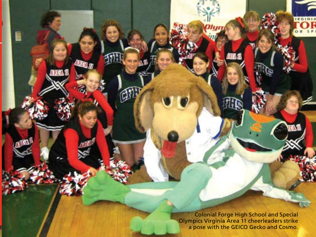
Colonial Forge High School and Special Olympics Virginia Area 11 cheerleaders strike a pose with the GEICO Gecko and Cosmo.

So, the next time you stop at your neighborhood Sheetz location for gas, a made-to-order food item or specialty beverage from the Sheetz espresso bar, be sure to say a big thank-you to the friendly manager and employees!