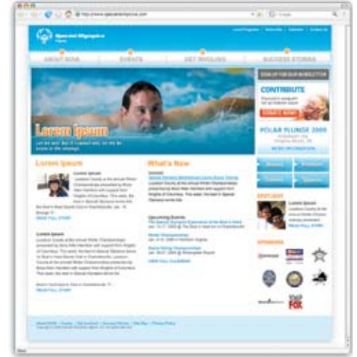
specialolympicsva.org new look is coming soon.

Again, we look forward to serving you better at specialolympicsva.org .